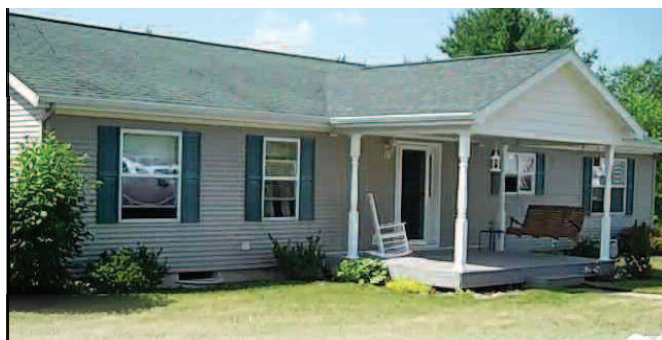
00911 Anderson Road, Boyne City PRICE REDUCED TO $174,000!

Well maintained property in great location in Boyne City School District. BATweb remote heat/cooling thermostat, "invisible" dog fence, and covered front porch, retractable awning over rear deck with southern exposure. Extra large garage with plenty of room for cars and Northern Michigan toys.